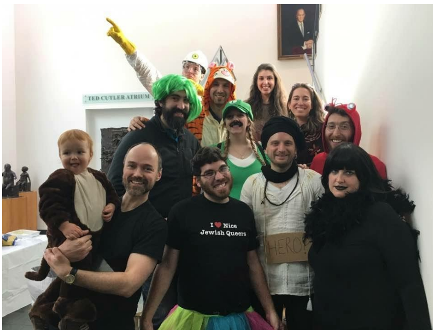
Rabbinical School students (and little family members) celebrating Purim last weekend.