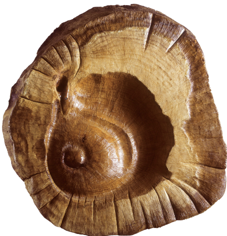
LIGHT IN THE FIRMAMENT OF THE HEAVEN