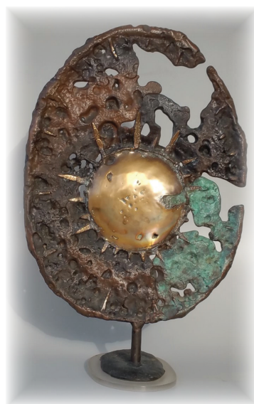
THE GREATER LIGHT