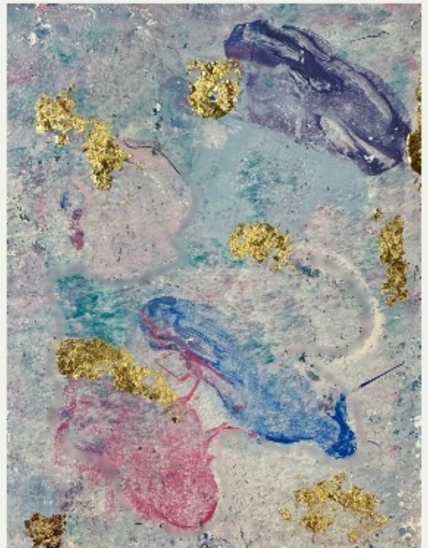
artwork from JSP session

Creative Facilitator Training Cohort 4 Jewish Studio Project